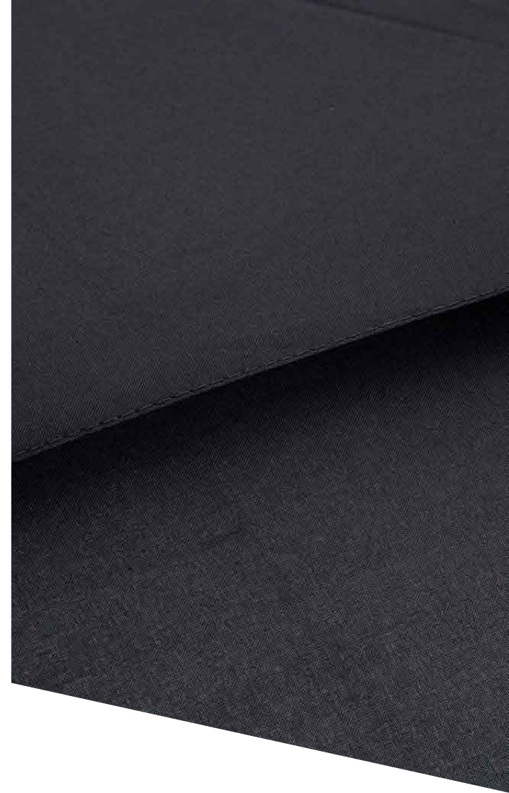
Softer cloth, higher strength