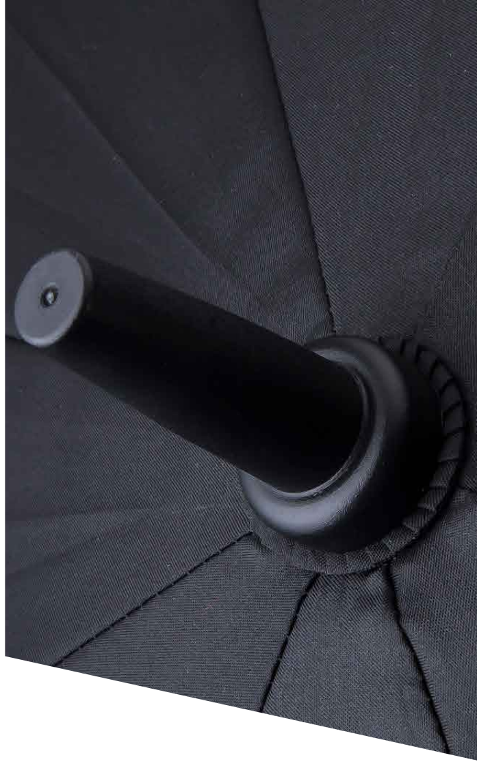
Umbrella hat design